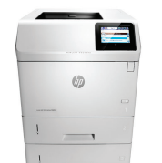
HP LaserJet Enterprise M605x