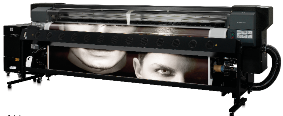
HP Designjet 10000s Complete Solution