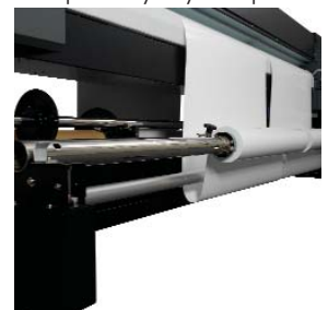
Dual Roll printing