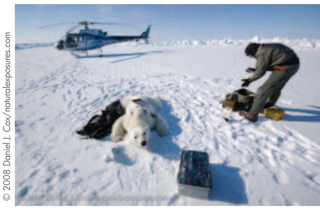
A preservation scientist researches a sleeping polar bear.

He began working with the HP Designjet 130 Photo Printer to produce prints up to 24 inches wide, and then moved to the Designjet Z3100 Photo Printer when it became available, enabling him to print up to 44 inches wide. The Z3100, and now the Z3200 printer, also employ more color management tools to improve color fidelity. Case in point: a built-in spectrophotometer,* allowing Cox to develop custom