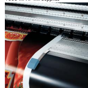
Adjustable vacuum system