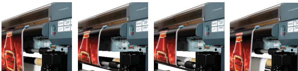
Detail on Take-Up Reel with four winding modes