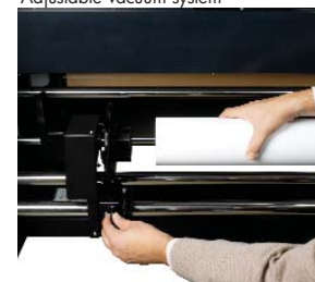
Easy media loading