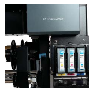
1000 ml HP Ink Supplies