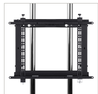
Compatible with B-Tech's collar and pole system for pole mounting screens.