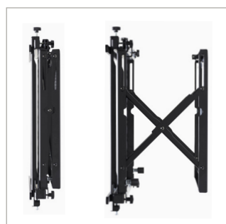
Pop-out system provides quick and easy service access.