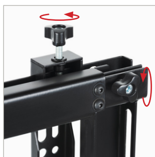
Tool less micro-adjustment for a seamless display alignment.