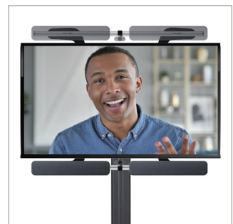
Suitable for mounting either above or below screens from B-Tech Columns or Poles.