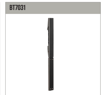
BT7031 Adjustable Accessory Mounting Arm allows the user to fit a variety of VC and UC video bar and speaker adapter plates to B-Tech wall mounts and the System X BT8390 Rail