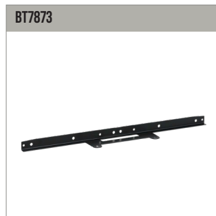
BT7873 Mounting Plate for Logitech™ Rally Bar and Bar Mini allows the user to fit Logitech videobars to a variety of B-Tech products