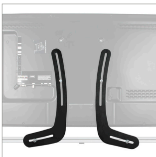
Designed to be universal compliant with all VESA compatible screens