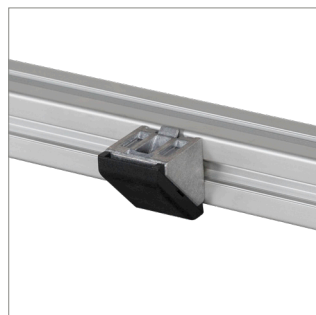
Central mount for locating the Lenovo Google Series One camera