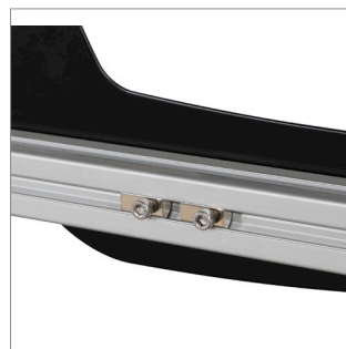
Speaker mounting points are fully adjustable along the length of the rail