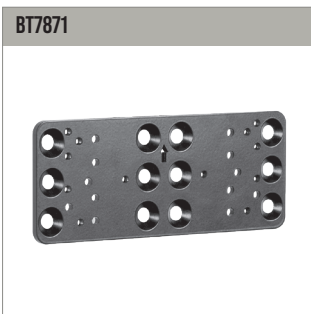
BT7871 Mounting Plate for UC/VC Video Bars allows the user to fit a variety of videobars / UC equipment to a range of B-Tech products