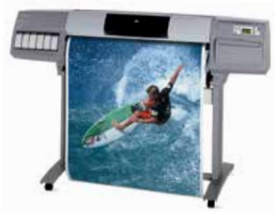
HP Designjet 5000/5500 Printer series

From the HP Designjet 5000/5500 Printer series to the HP Designjet Z6800 Photo Production Printer and the HP Designjet Z6600 Production Printer