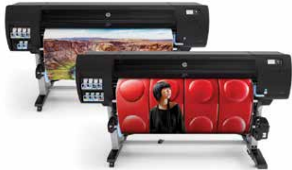
HP Designjet Z6800 Photo Production Printer HP Designjet Z6600 Production Printer