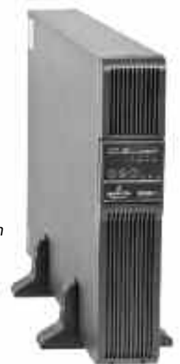
PSI XR 2U Tower version