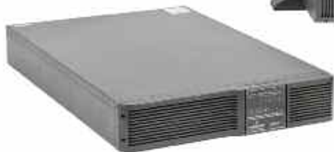
PSI XR 2U Rack version