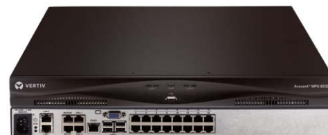
Avocent MergePoint Unity™ 32-port switch