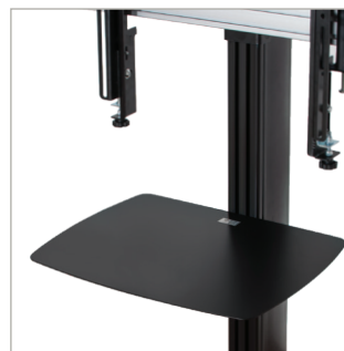
Fit System 2 compatible accessories such as shelves without using collars