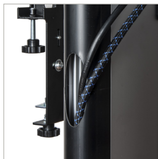
Cable management covers hide untidy cables and add to the stylish finish