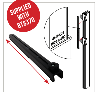
Screen spacer designed to eliminate calculations and guess work when installing horizontal rails