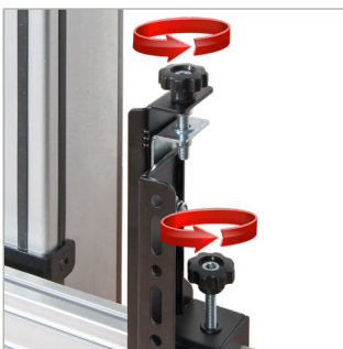
8 point tool-less micro-adjustment for seamless screen alignment