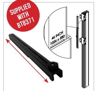
Screen spacer designed to eliminate calculations and guess work when installing horizontal rails