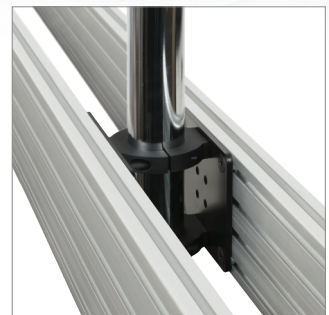
Suitable for back-to-back configurations (multiple brackets required)