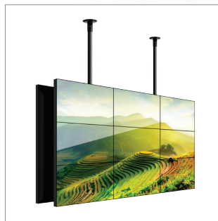
Heavy duty steel plate capable of supporting heavy loads