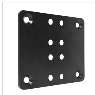
Countersunk fixing holes keep the install looking neat and tidy