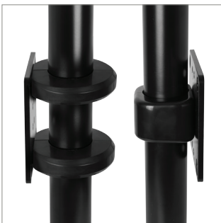
For use with 2x BT7841 2-Piece Collars or 1x BT7051