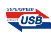
2x USB 3.0 4x USB 2.0