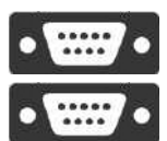
2x COM 1x Parallel