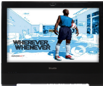
Digital Signage Visual advertising, entertainment, displaying information in public areas