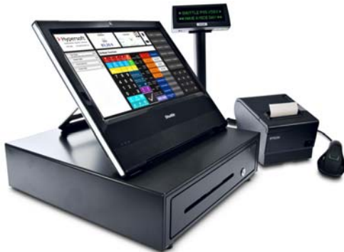
P.O.S. Point of sales