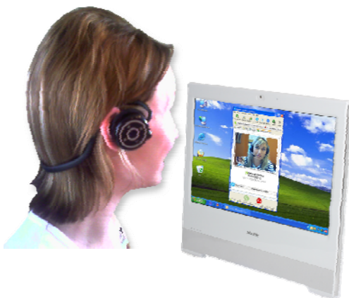
Communication Email, VoIP, Messenger, Blog, Video Conferencing