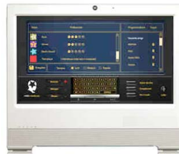
Instore Radio Playing advertising and music

© 2016 by Shuttle Computer Handels GmbH (Germany). All information subject to change without notice. Pictures for illustration purposes only.