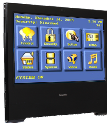
Control Surveillance, Home Automation, Control device