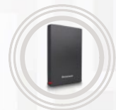
Lenovo UHD F309 1TB Portable Secure Hard Drive