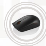
Lenovo 300 Wireless Compact Mouse