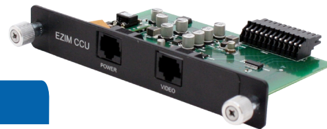
EZIM Slot Card fits into the card slot of the HD-20, HD-19 and HD-18 Cameras