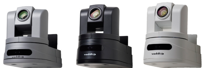
WallVIEW Universal CCU CAT-5 Versions with CONCEAL Mounts (left to right), HD-20, HD-19 (black) and HD-18AW (Arctic White)