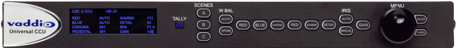
Universal CCU for Vaddio WallVIEW™ HD-20, HD-19 and HD-18 PTZ Camera Systems

CAT-5 Version of the Quick-Connect™ Universal CCU for Vaddio™ PTZ Cameras