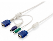
ACC-2101 1.8m PS/2 and USB KVM Cable