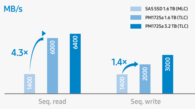
Figure 1. Sequential R/W performance comparison between an MLC SAS SSD and the 1.6 and 3.2 TB TLC PM1725a

The following figures compare the performance of a Samsung enterprise SAS SSD, which uses MLC V-NAND flash memory, with the TLC-based PM1725a. With comparable cost, the PM1725a provides up to 4.3 times more bandwidth than the MLC-based SAS SSD for sequential read and up to 5 times more IOPS for 4 KB random read.