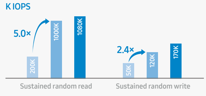
Figure 2. Sustained random R/W performance comparison between an MLC SAS SSD and the 1.6 and 3.2 TB PM1725a