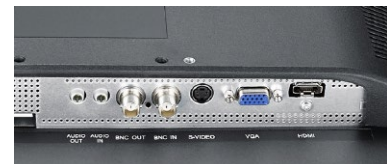
Video versatility, including VGA, HDMI, S-Video and BNC In/Out