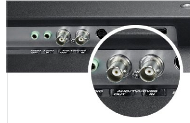
AHD 2.0 / TVI 2.0 / CVBS (960H/720H) inputs bring forth mega-pixel images without interruption or delay