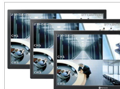
Looping BNC video inputs allow multiple display connections