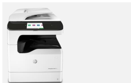
HP PageWide Pro MFP 777z