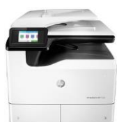
HP PageWide Pro MFP 772dn