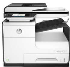
HP PageWide Pro MFP 477dw