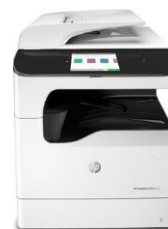
HP PageWide Pro MFP 777z