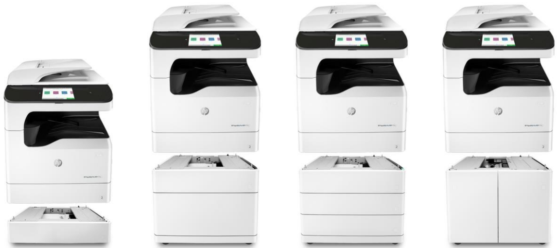
550-sheet paper tray (P1V16A) 22 Supports up to A3 size