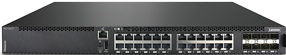
Figure 1. Lenovo ThinkSystem NE1032T RackSwitch

The Lenovo ThinkSystem NE1032T RackSwitch is shown in the following figure.