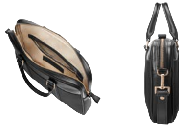
HP Ladies 14.0" Slim Top Load