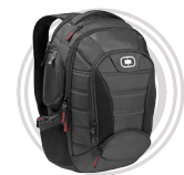
Ogio Bandit 17" Backpack (Black) PN: 111074.03