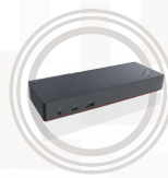
ThinkPad Thunderbolt 3 Dock