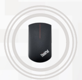
ThinkPad Precision Wireless Mouse