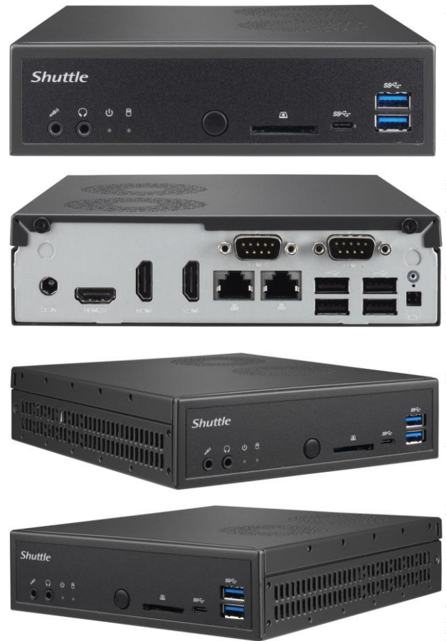
Images for illustration only. Processor, memory, storage and operating system not included.