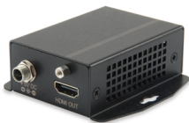
HVE-9111RF HDMI over Cat.5 Receiver, 300m, Full HD 1080P