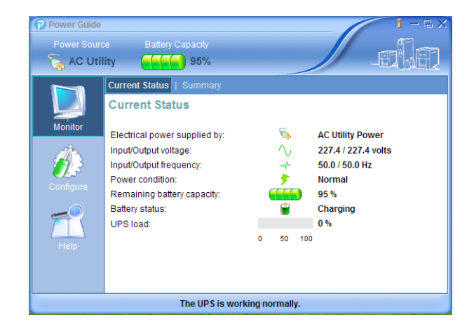
Fig. 3. View of a software screen.

Power Panel is a UPS monitoring software which provides a user-friendly interface for monitoring and control. It features an auto shutdown function for systems consisting of several PCs in case of power failure. The software enables users to monitor and control any UPS in the same LAN through an RS232 or USB communications port, regardless of how far away they are from each other. Fig. 3 shows a Power Panel software screen.