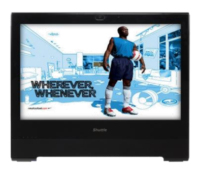
Digital Signage Visual advertising, entertainment, displaying information in public areas