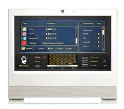
Instore Radio Playing advertising and music