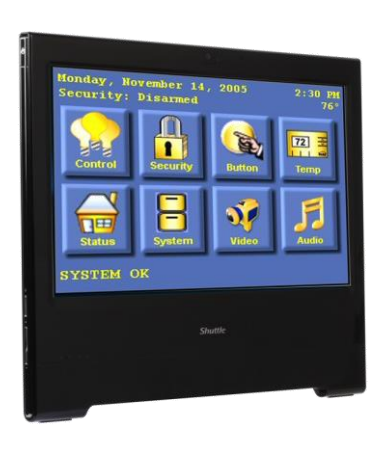
Control Surveillance, Home Automation, Control device