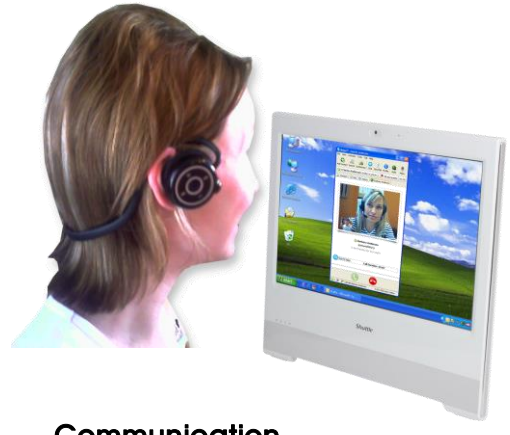
Communication Email, VoIP, Messenger, Blog, Video Conferencing