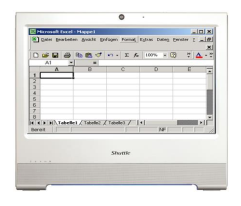
Office Work Word and spreadsheet processing, email, internet