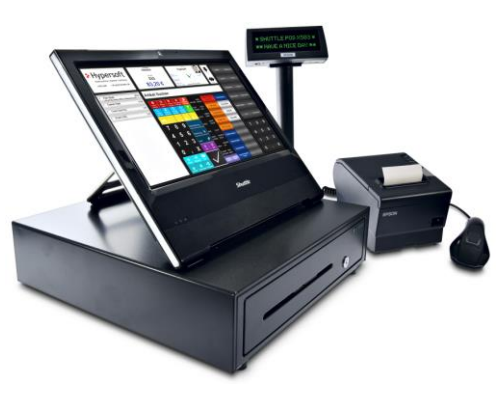
P.O.S. Point of sales