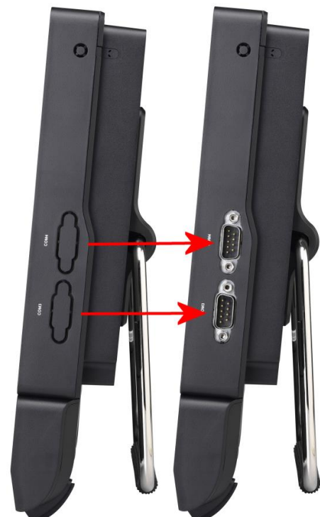
Shuttle XPC all-in-one P20U before and after the installation of PCP21