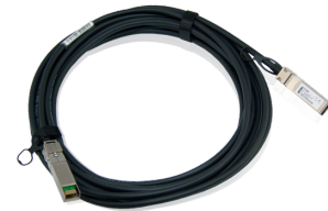
Figure 1. Cable (non-binding illustration)