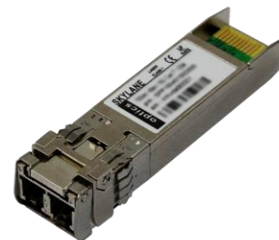
Figure 1. SFP+ Dual Fibre (non-binding illustration)