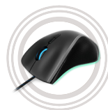
Lenovo Legion M500 RGB Gaming Mouse