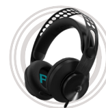
Legion H300 Stereo Gaming Headset