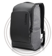
Lenovo Legion 15.6" Recon Gaming Backpack

* Example of Lenovo Legion catalogue naming convention