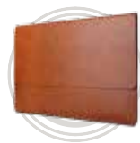
Yoga 920 Sleeve