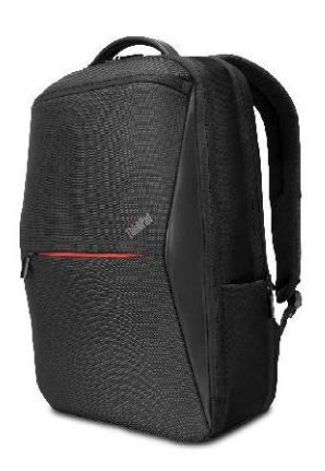
ThinkPad Professional 15.6" Backpack (PN:

Optimized for safeguarding essential data while on the go, this hard drive offers high-level, 256-bit Advanced Encryption Standard (AES) security within a slim, lightweight, self-powered, and easy-to-use design. It features an integrated, high-quality, metal dome switch keypad for entering an 8 to 16 digit password for one administrator ID and one additional user ID, if required.