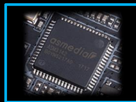
ASMedia 3142 USB 3.1 Controller