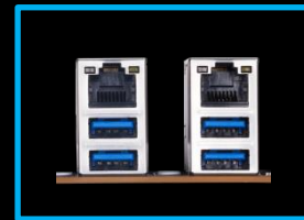
Dual Intel i210AT LAN