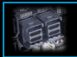
Dual U.2 Connectors