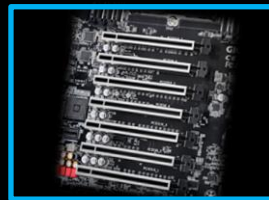
7 PCIe x16 slots for Multi Cards