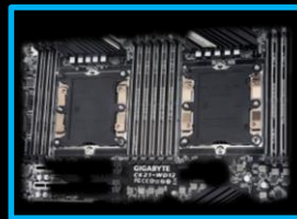
6-Channel DDR4 RDIMM/LRDIMM 8 x DIMMs, up to 1.5TB