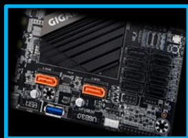
10 SATA3 Connectors