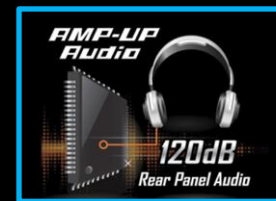
AMP-UP Audio 120dB Rear Panel Audio