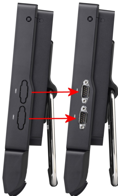
Shuttle XPC all-in-one P20U before and after the installation of two PCP11 adapters