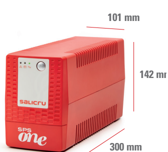
SPS 500-900 ONE (UK/IEC)