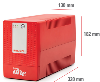
SPS 1100 ONE (UK/IEC)