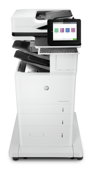
HP LaserJet Enterprise Flow MFP M635z

This HP LaserJet MFP with JetIntelligence combines exceptional performance and energy efficiency with professional-quality documents right when you need them – all while protecting your network from attacks with the industry's deepest security.<sup>1</sup>