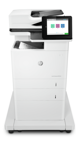
HP LaserJet Enterprise MFP M635fht

Dynamic security enabled printer. Only intended to be used with cartridges using an HP original chip. Cartridges using a non-HP chip may not work, and those that work today may not work in the future. Learn more at: http://www.hp.com/go/learnaboutsupplies