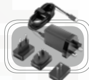
Lenovo 65W USB-C AC Travel Adapter

* Example of Lenovo IdeaPad Flex catalogue naming convention