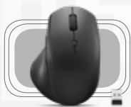
Lenovo 600 Bluetooth® Silent Mouse