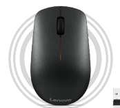
Lenovo 400 Wireless Mouse