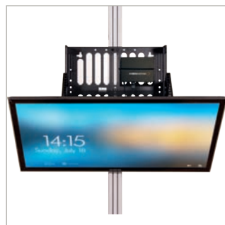
Media players can also be mounted to the cradle