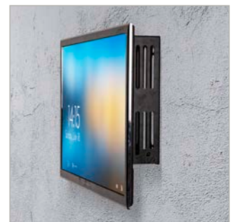
Can mount screens in a landscape or portrait orientation directly to the wall