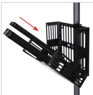
Tray opens 45° for easy access to equipment