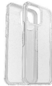
Stardust 77-84359 840104274286