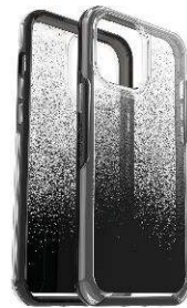
Ombre Spray 77-84353 840104274224