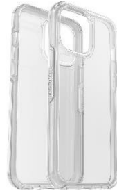
Clear 77-84347 840104274163