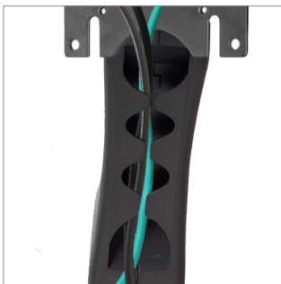
Cable management integrated throughout the mount for a neat and tidy installation