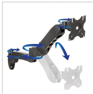
Full motion adjustability allows easy screen positioning for the perfect display