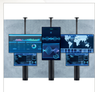
Can be used to create large scale installations - ideal for control rooms.