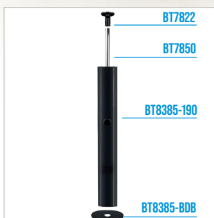
Requires the use of a BT8385 Column, BT7850 Ø50mm pole, BT7822 Ceiling Mount & BT8385-BDB Bolt Down Base.