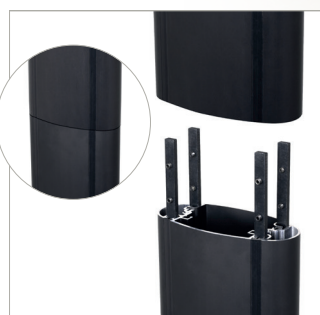
Supplied with Extension Bars for joining vertical columns together for extended heights if required.