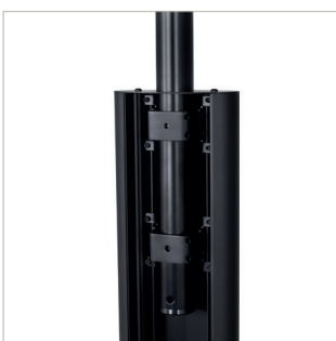
Fitted easily to the inside of a BT8385 Vertical Column.