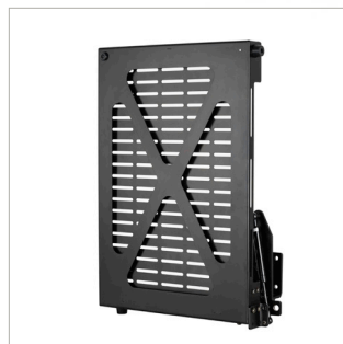
Designed for use with BT7884 Flip-Down AV Storage Mount