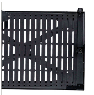
Storage Tray can be quickly released from the BT7884 and changed over easily