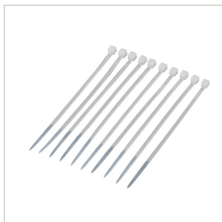
Cable ties included to fix AV equipment to the tray