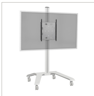
Suitable for 55" and 65" Samsung Flip 2 screens