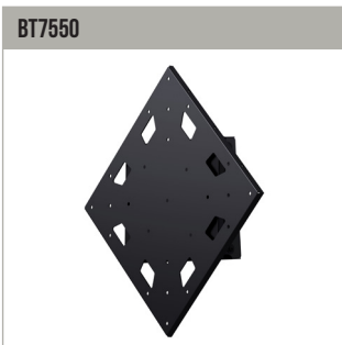
BT7550 Rotational Flip Mount for screens up to 37" to 65" including Samsung's Flip and Flip 2