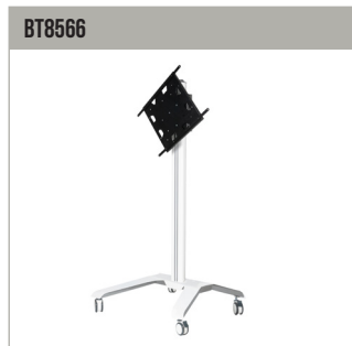
BT8566 Flat Screen Trolley with Flip Rotation for Samsung Flip and Flip 2 screens