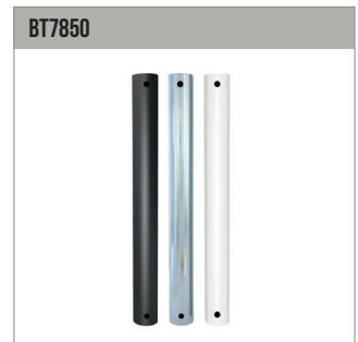
BT7850 Ø50mm Poles are designed to combine with B-Tech floor bases or ceiling mounts. Available in Black, Chrome or White.