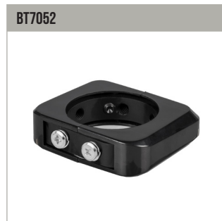
BT7052 Ø50mm Accessory Collar Designed to attach a variety of different mounts and accessories onto B-Tech poles