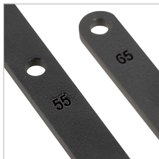
Integrated markings indicate the correct fixing points to use with either the 55" or 65" display