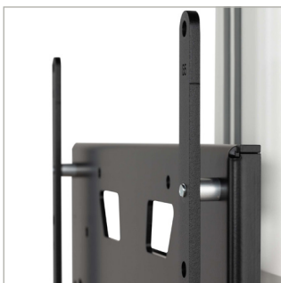
Fixings and spacers to attach to B-Tech Rotational Flip Mount are included