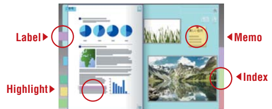
Table of contents, Index, Highlight, Label, Stamp, Page zoomed in/zoomed out, Page rotation, Page swapping, Thumbnail display, Hyperlink