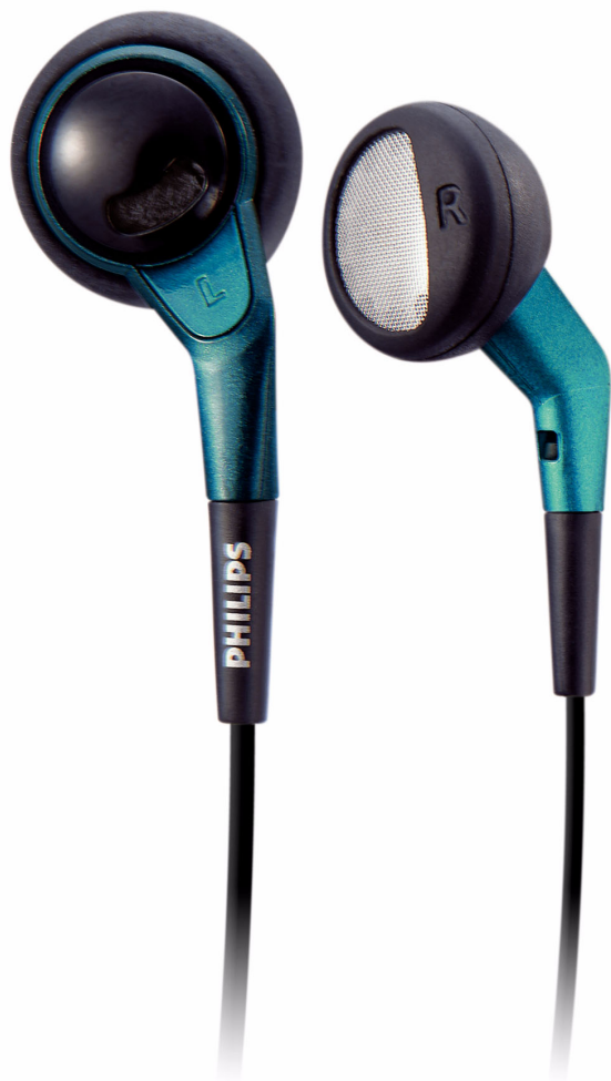
Philips In-Ear Neckstrap Headphones