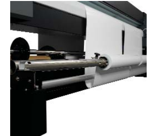
Dual Roll printing