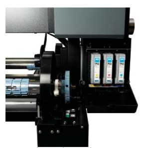
1000 ml HP Ink Supplies