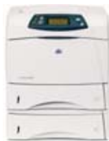
HP LaserJet 4350tn printer