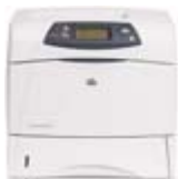
HP LaserJet 4350n printer