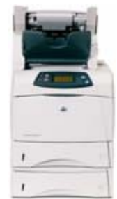
HP LaserJet 4350dtnsl printer