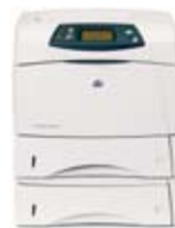
HP LaserJet 4350dtn printer