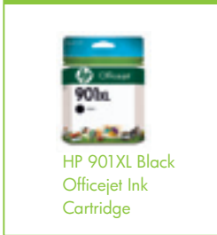
HP 901XL Black Officejet Ink Cartridge

Print more, save more with high-capacity cartridges and multi-packs