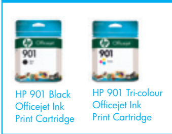
HP 901 Black Officejet Ink Print Cartridge HP 901 Tri-colour Officejet Ink Print Cartridge

Reliable ink for precise, everyday printing