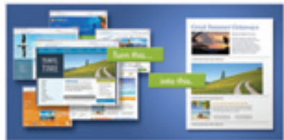
Print web pages easily with HP Smart web printing