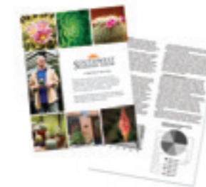
Get impressive documents with HP Officejet inks